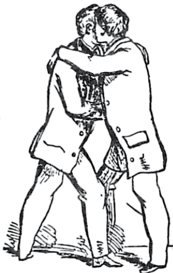
MASTER GIVING THE GRAND MASONIC WORD ON THE FIVE POINTS OF FELLOWSHIP.

All the brethren take their seats but the Master and candidate, when the Master continues: