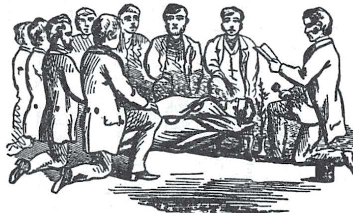
BRETHREN KNEELING AT PRAYER AROUND THE GRAVE OF HIRAM ABIFF, THE WIDOW'S SON.

Thou, O God! knowest our down-sitting and our uprising, and understandest our thoughts afar off. Shield and defend us from the evil intentions of our enemies, and support us under the trials and afflictions we are destined to endure, while travelling through this vale of tears. Man that is born of a woman is of few days and full of trouble. He cometh forth as a flower, and is cut down: he fleeth also as a shadow, and continueth not. Seeing his days are determined, the number of his months are with thee; thou hast appointed his bounds that he cannot pass; turn from him that he may rest, till he shall accomplish his day. For there is hope of a tree, if it be cut down, that it will