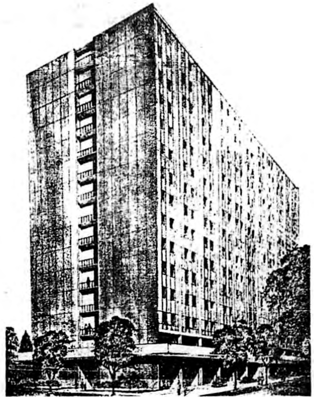
Architects drawing of the new Archives Building to be built opposite the Administration Building.

Construction of the Archives Building may begin in approximately a year to 15 months, Mr. Dunn said. ( Deseret News , October 7, 1960 page 1 and 10A)