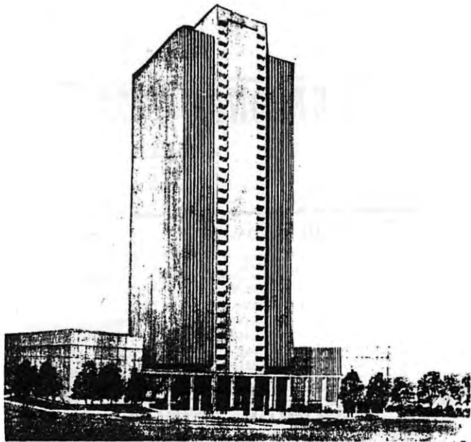
NEW CHURCH ADMINISTRATION OFFICE. This is the front view from North Temple street in foreground of proposed 36-story office building for Church of Jesus Christ of Latter-day Saints, announced Friday. New mission headquarters and home would be located in right wing.